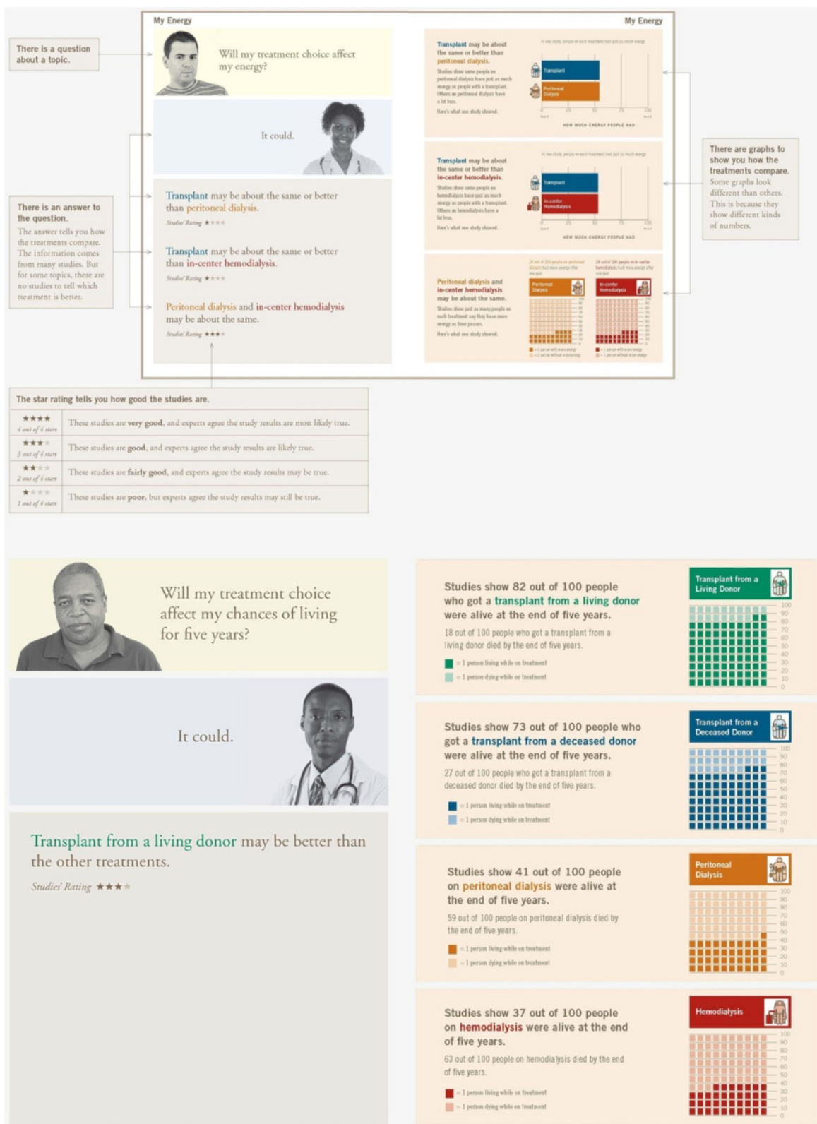
Figure 3 Sample pages from final handbook.