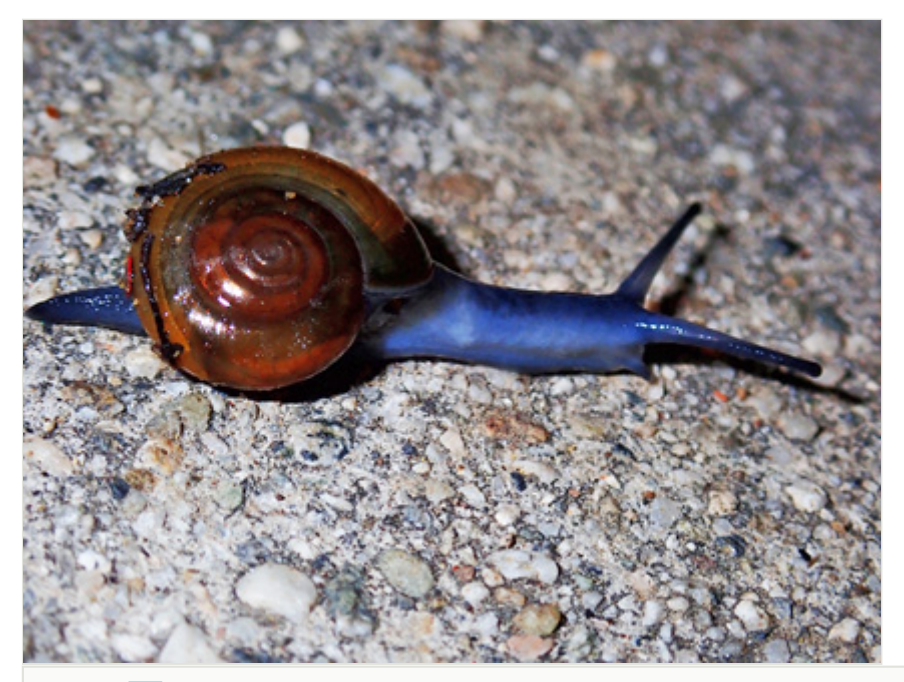
Figure 2. doi Living individual of Oxychilus draparnaudi (Beck).

A third collecting event took place at the Natural History Museum of Los Angeles County Nature Garden on 17 August 2019. Three snails were crushed, attracting a single female M. steptoeae in ten minutes. One of the snails was barcoded to verify the identification as O. draparnaudi .