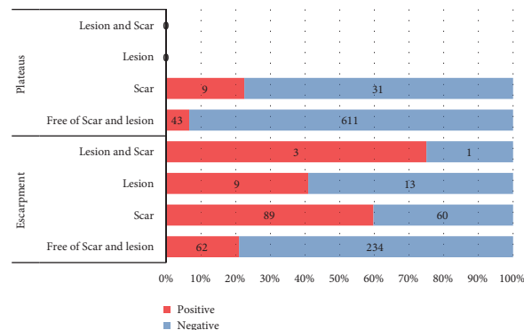
FIGURE 2: Prevalence of LST positivity in escarpment and plateaus areas.

The overall prevalence of LST positivity was 18.5% (215 out of 1165). The LST positivity reaction was prevalent within the participants who are living in escarpment land