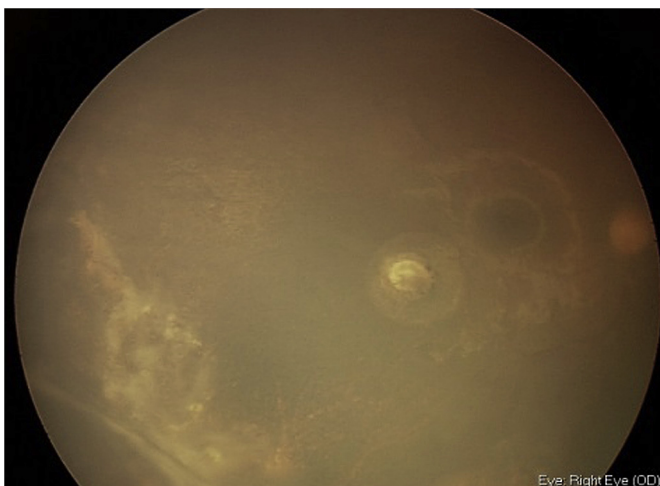
Fig. 3. Wide Field RetCam image showing new tumor growth regression in the right eye after combined treatment.

All authors attest that they meet the current ICMJE criteria for Authorship.