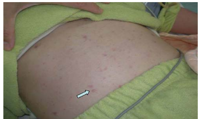
Fig. 1 Photograph of the patient showing multiple petechial spots over the abdominal wall

A 31-year-old woman without history of systemic diseases presented to the emergency department with spiking fever, chills, generalized myalgia, severe epigastralgia, and watery diarrhea for 1 day. Flulike symptoms had been noted for several days. Progressive extension of petechiae skin purpura (Fig. 1) developed within 2–3 h upon arrival at the hospital. Low blood pressure persisted despite vigorous fluid resuscitation. Laboratory results showed bacteremia without obvious leukocytosis, low platelet counts, severe metabolic acidosis, and prolonged prothrombin time and partial thromboplastin time. Computed tomography of the abdomen was arranged to search for a possible intra-abdominal lesion, which could be causing the septic shock and severe abdominal pain (Fig. 2). The patient died after approximately 10 h of vigorous fluid resuscitation, inotropic agents, and antibiotics with quinolones. No emergent dialysis was arranged.