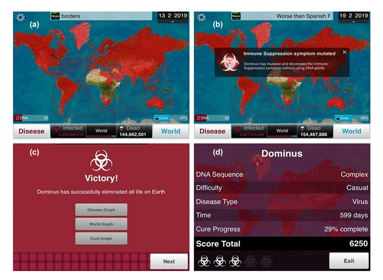
Figure 1. (a) Plague Inc. in progress showing the spread of disease, number of dead and infected, routes of transmission and cure progression. (b) Example of automatic evolution of the pathogen 'immune suppression'. (c) Victory message if the player is successful in destroying all life on earth with options to view graphical displays of the progress of the pathogen. (d) Results after completion of the game.

population by controlling a pathogen and selecting its specific traits such as transmission and symptoms. Humanity fights against the pathogen through the development of a cure that you monitor as a progressing percentage value (see Fig. 1a–d). In order to stay ahead, you find ways to strengthen your pathogen and increase its infection rate with the goal of wiping out the population before the cure can be developed.