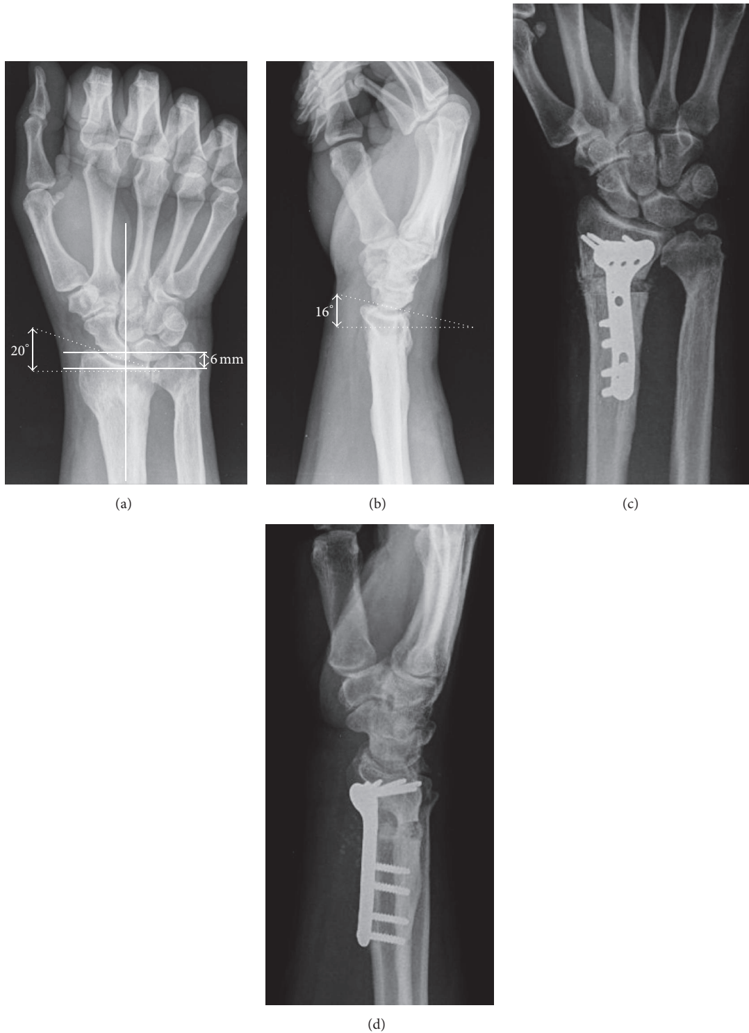
FIGURE 1: (a-b) Plain radiographs preoperative images showed DR malunion with a loss of volar tilt ( -15^\circ ), radial inclination ( 20^\circ ), and positive ulnar variance (6 mm). (c-d) Postoperative radiographs showed DR osteotomy with a correction of volar tilt ( 2^\circ ), radial inclination ( 22^\circ ), and ulnar variance (0 mm).

because wrist range of motion was complete (same ROM as the contralateral wrist) and pain-free, although progressive radiographs showed radiolucent lines surrounding the graft at the osteotomy site without plate bending or screw loosening. Four months after the operation, radiographs showed