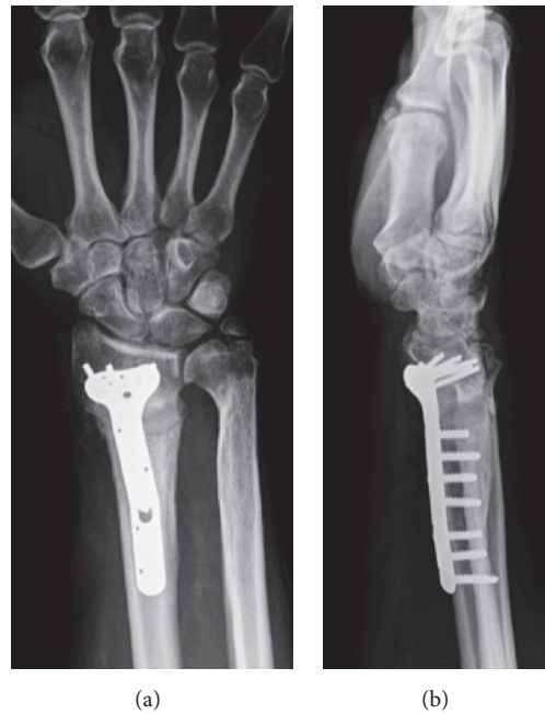
FIGURE 3: (a-b) Plain radiographs postoperative images at 8-month follow-up showed DR fixation with a longer stainless steel volar locking plate.

mechanical factors (unfilled screw holes and insufficient immobilization).