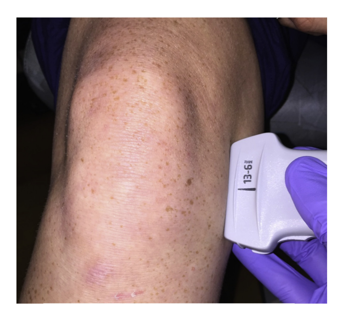
Figure 1 Evaluation of the medial compartment of the knee using a linear ultrasound probe.

Each ultrasound study was performed using a SonoSite Mturbo machine (FUJIFILM Sonosite Inc, Bothell WA) with a 6-15 MHz linear probe. For examination of the medial knee, the patient was asked to rotate the leg externally while maintaining 20^{\circ}-30^{\circ} of knee flexion. The transducer was placed obliquely over the long-axis of the medial collateral ligament (Fig. 1). Care was taken to examine the entire length of the medial collateral ligament (Fig. 2). A normal MCL is seen in a longitudinal plane as a thick hyperechoic and fibrillar structure, extending from the medial femoral condyle to the proximal tibia. If a tear of the MCL was noted, the degree of tear was classified using the following designation: Grade 1 (Mild; stretching of the ligament without discontinuity of the fibers and associated