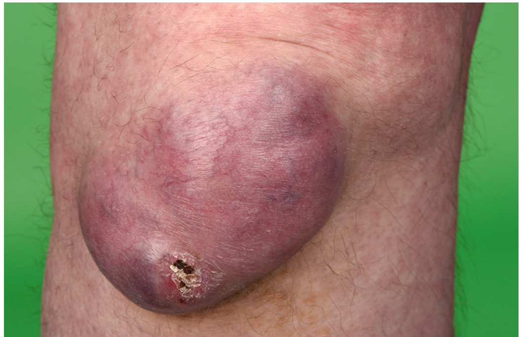
FIGURE 1: Clinical photography of the lesion on the right knee

history of a slow-growing, large and fluctuant mass on his right knee. There was no associated discharge, pain or history of trauma. Clinical examination revealed a 7.5 cm x 7.5 cm x 3.5 cm purple lesion over the infrapatellar region with healthy overlying skin (Figure 1). There were no other lesions present elsewhere and no palpable regional lymphadenopathy. MRI with contrast of the knee identified a large loculated cyst lying anterior to the infra-patellar tendon with no communication with the knee joint. Additionally, a lateral meniscal cyst associated with an extensive meniscal tear was also identified (Figure 2). On consultation with the orthopaedic team, intra-articular communication was excluded and an opinion was sought from the plastic surgery team for excision of the cyst and reconstruction. Unfortunately, the patient became lost to follow up for two years before histological diagnosis. On re-presentation, the mass had increased in size and the patient was referred back to the plastic surgery department. This time, the lesion was excised and sent for histology.