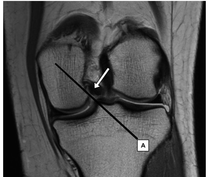
Fig. 1. 47-year-old woman with low grade chondral lesion at retro-patellar cartilage. Proton density weighted (repetition time, 2200 msec; echo time, 30 msec) coronal MR image of left knee. Medial margin of PCL is located lateral to line between inferomedial corner of medial femoral condyle and medial tibial spine (arrow). This case was classified as negative for interposition of PCL into medial compartment of knee joint. PCL = posterior cruciate ligament

Prevalence showed no significant right (50.0%, 83/166) or left (43.7%, 66/151) predominance ( p = 0.518). Male (50.3%, 87/173) and female (43.1%, 62/144) differences were also not statistically significant ( p = 0.415). There was