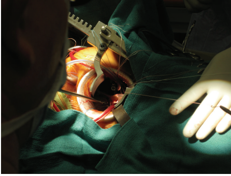
FIGURE 1: Level 2 minimally invasive approach (4–6 cm incision).