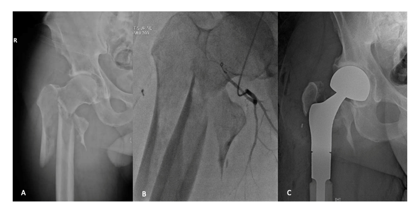
Figure 2. A 49-year-old male who presented with a pathologic fracture through an extensive lytic lesion in the pertrochanteric and subtrochanteric region ( A ). Staging and workup found this to be an isolated renal cell carcinoma metastases. Pre-operative angio-embolization was undertaken ( B ), and the metastatic deposit was treated with en-bloc resection and reconstruction with proximal femoral replacement ( C ).