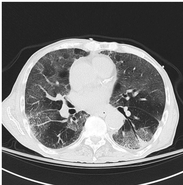
Figure 1. CT scan of chest showing bilateral diffuse ground glass opacity of lung parenchyma on presentation.

started on intravenous cefepime and metronidazole (2-week course) for broad-spectrum coverage of pneumonia. Resolution of eosinophilia (0.8%) with the appearance of neutrophilic leucocytosis (92.3% neutrophils with WBC of 12,500/ \mu l) were noted. With improvement of his respiratory status, his methylprednisolone was stopped, and he was started on prednisone taper for 6 weeks. He was also started on prophylactic sulfamethoxazole-trimethoprim 800/160 mg two times daily until his prednisone would drop down to 20 mg daily. High flow oxygen was weaned off to nasal cannula oxygen.