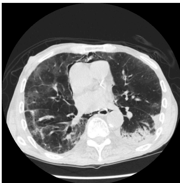
Figure 2. CT scan of chest showing improved opacity of lung parenchyma 2 weeks after discontinuation of daptomycin.

DAEP was first reported in 2007. DAEP is characterized by eosinophilic infiltration of the lung parenchyma ranging from asymptomatic infiltrates to acute respiratory distress syndrome necessitating mechanical ventilation [4]. It is believed that parenchymal damage secondary to destruction of