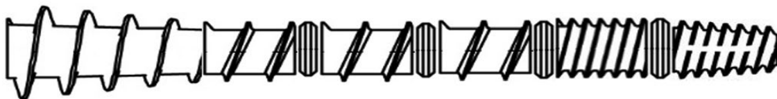
Figure 1. Schematic of extruder screw profile. Inlet starting on the left to discharge ending on the right. Screw element 1: inlet screw, single flight full pitch; 2: single flight, full pitch screw; 3: small steam lock; 4: single flight full pitch screw; 5: small steam lock; 6: Single flight, full pitch screw; 7: medium steam lock; 8: double flight, 1/2 pitch screw; 9: Large steam lock; 10: double flight, 1/2 pitch, cut cone screw.

Texture analysis was performed using a texture analyzer (model TA-XT2, Texture Technology Corp., Scarsdale, NJ)