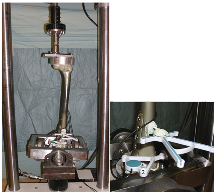
Figure 3 Overview of the test setup used. Left: the entire setup, the femur loaded in the MTS. Right: Close-up of the measuring system; 1 and 2, microphone and speaker templates.

SCO was defined as the difference between the maximum increase and maximum decrease in the distance between measuring points; determined for each cycle and per measuring point. A greater mean difference calculated over 100 cycles and 3 measuring points indicates more motion allowed by the bone-implant construct. Stability was subsequently defined as the amount of motion allowed by the construct. A similar approach was used in the torsional tests. The amount of motion was calculated by determining the amount of rotation around the Z-axis that is allowed by the bone-implant construct during each cycle. Stability in torsion was defined as the amount of rotation allowed by the construct. The stiffness under axial compression of the construct was calculated by plotting displacement at the SCO during the failure test, defined as the average amount of movement on the Z-axis of the 3 previously defined point pairs, against the force data. Stiffness of the bone-implant construct was defined as the slope of the linear portion of the force - deformation curve (i.e. the force required per millimeter of displacement). Stiffness under torsion loading was calculated by plotting the rotation around the Z-axis over time against the moment (Nm) applied by the MTS and defined as Nm required for one degree of rotation.