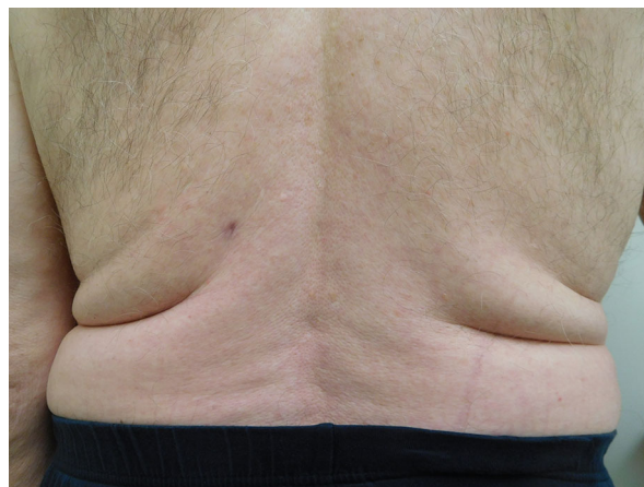
Fig. 4 Distant view of the complete resolution of the cutaneous Staphylococcus lugdunensis skin and soft tissue infection on the back of an 82-year-old man that resolved after 30 days of treatment with cephalexin 500 mg four times daily

He was treated with incision and drainage; empiric oral antibiotic treatment was initiated with cephalexin 500 mg, four times daily, and