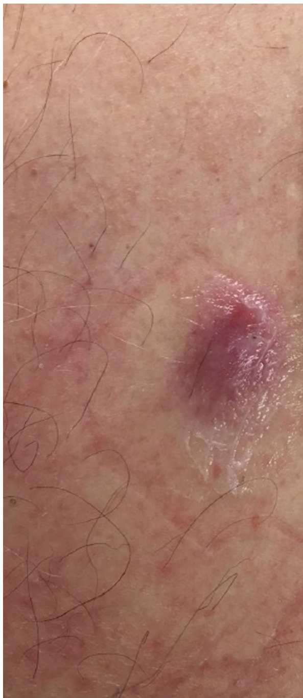
Fig. 3 Close-up view of an inflamed cystic lesion with surrounding erythema from which Staphylococcus lugdunensis was cultured on the left lower back of an 82-year-old man

He was treated with incision and drainage; empiric oral antibiotic treatment was initiated with cephalexin 500 mg, four times daily, and