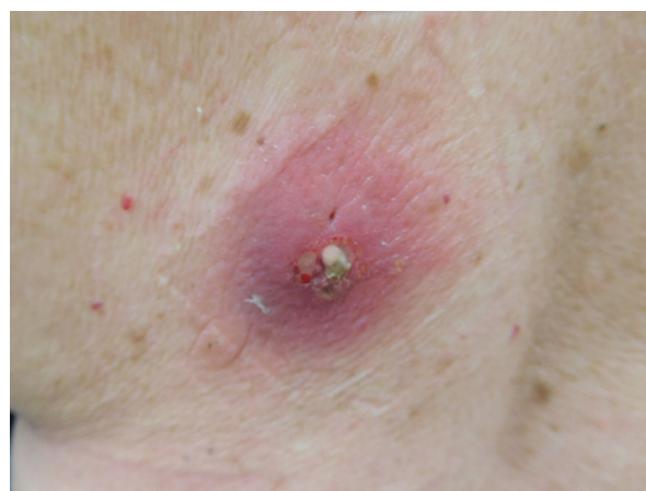
Fig. 2 Closer view of Staphylococcus lugdunensis cutaneous infection of the back of a 70-year-old woman; the infection occurred at a presumed bite site