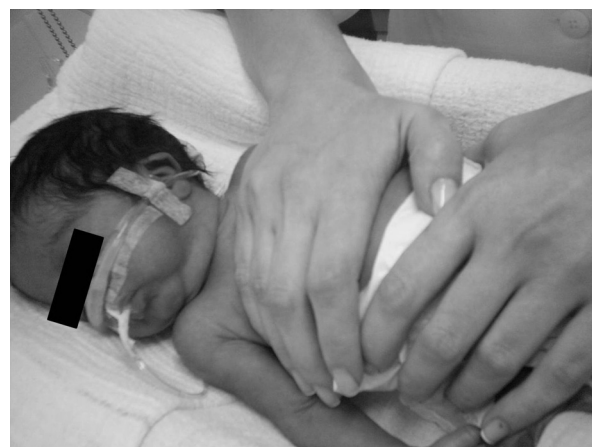
Figure 1 Respiratory physiotherapy technique of expiratory flow increase in preterm newborns.

The examinations were carried out with the newborn in the supine position with the head in midline position, and kept at rest or reduced motor activity for approximately 10min, after which the brain ultrasound was performed to exclude brain lesions and, subsequently, the first Doppler ultrasound examination ( T_0 ) was performed. After that, the expiratory flow increase (EFI) maneuvers were performed for 5min. The examination was repeated on the second ( T_1 ) and fifth ( T_2 ) minutes of respiratory physiotherapy and 10min after completion of the maneuvers ( T_3 ). After the tests, the newborns received nursing care, according to the service routine. The examinations were performed one hour before the following feeding to prevent vomiting and bronchoaspiration. Fasting patients and those fed by continuous infusion through infusion pump or parenteral nutrition were assessed one hour before the subsequent nursing care in order to not interrupt the newborn's resting and sleep time. Newborns that were restless or tearful during the physiotherapy session were calmed with a 25% sucrose solution and/or non-nutritive sucking with pacifier or a gloved finger. All routine brain ultrasonographic examinations, performed after the tests carried out for this study, were systematically followed by the researchers.