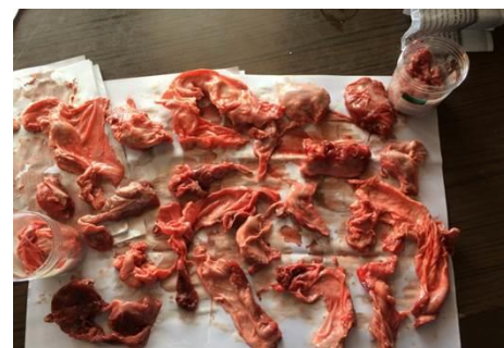
Fig. 2: Tongue and diaphragm of pig collected from different meat markets and slaughterhouses

Different meat market and slaughterhouse survey were carried out for the collection of samples (tongue and diaphragm) (Fig.2). No Trichinella larva was detected by HCL: Pepsin digestion method. For confirmation samples were again revalidated in Bombay Veterinary College, Mumbai, Maharashtra and result were found similar.