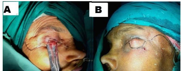
Fig. 1 A. Incision pattern of upper lid Tenzel reconstruction flap. B. Incision pattern of lower lid Tenzel reconstruction flap.