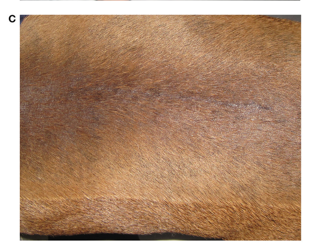
FIGURE 2 | Representative images of the two treatments groups at day 21. (A) A non-laser patient illustrating the continued presence of a scab over some of the incision's epithelium. (B) A non-laser patient with a wide scar area and one remaining pink area of granulation toward the right side of the incision. (C) A laser therapy patient showing a completely healed incision with contraction and hair regrowth around and on the incision.

Day 21 results were further compared for laser therapy and non-laser groups for eight patients using the six reviewers. One laser therapy dog did not return for the 21 day photograph. Dogs