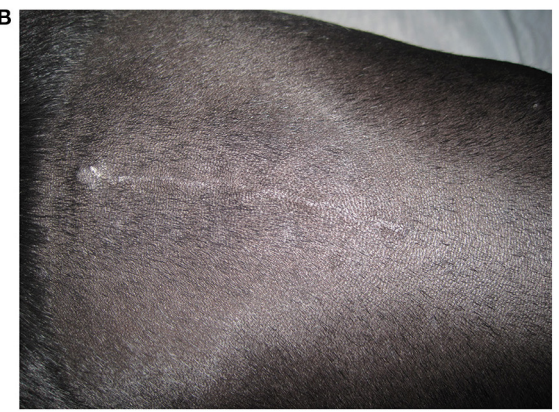
FIGURE 1 | Examples of the scar scale images used for reviewer ranking of surgical incisions for both treatment groups. (A) This image was defined as a scar scale score of zero. (B) This image was defined as a scar scale score of five

laser treatment, and had pictures taken at days 0, 1, 3, 5, 7, and 21. Upon completion of the study all pictures were randomly assigned a number, 1 through 125, using a computer generated<sup>4</sup>, unsorted list. The scar scale dog photographs were arranged on white cork board and labeled as 0, 1, 2, 3, 4, or 5 to define the scar scale. The board represented a score of 0 (day 0), 1 (day 1), 2 (day 3), 3 (day 5), 4 (day 7), and spaced linearly until the day 21 photographs which represented a scar scale score of 5. The treatment group photos were arranged in ascending numerical order according to their randomly assigned image number.