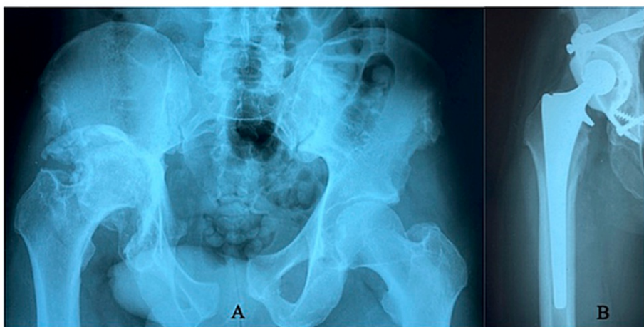
FIGURE 2: (A) Radiograph showing advanced post-traumatic osteoarthritis of the right hip with superior migration of the hip center and massive acetabular widening. (B) Postoperative radiograph showing good positioning of the hip replacement using a Burch-Schneider reinforcement cage and autograft to reconstruct the acetabulum.

Our team performed his primary arthroplasty using a cage to reconstruct the deficient posterior acetabular wall in combination with ultra-high-molecular-weight polyethylene cemented cup and an uncemented femoral stem. The patient tolerated the operation very well and returned to his work as a taxi driver eight weeks later (Figure 2).