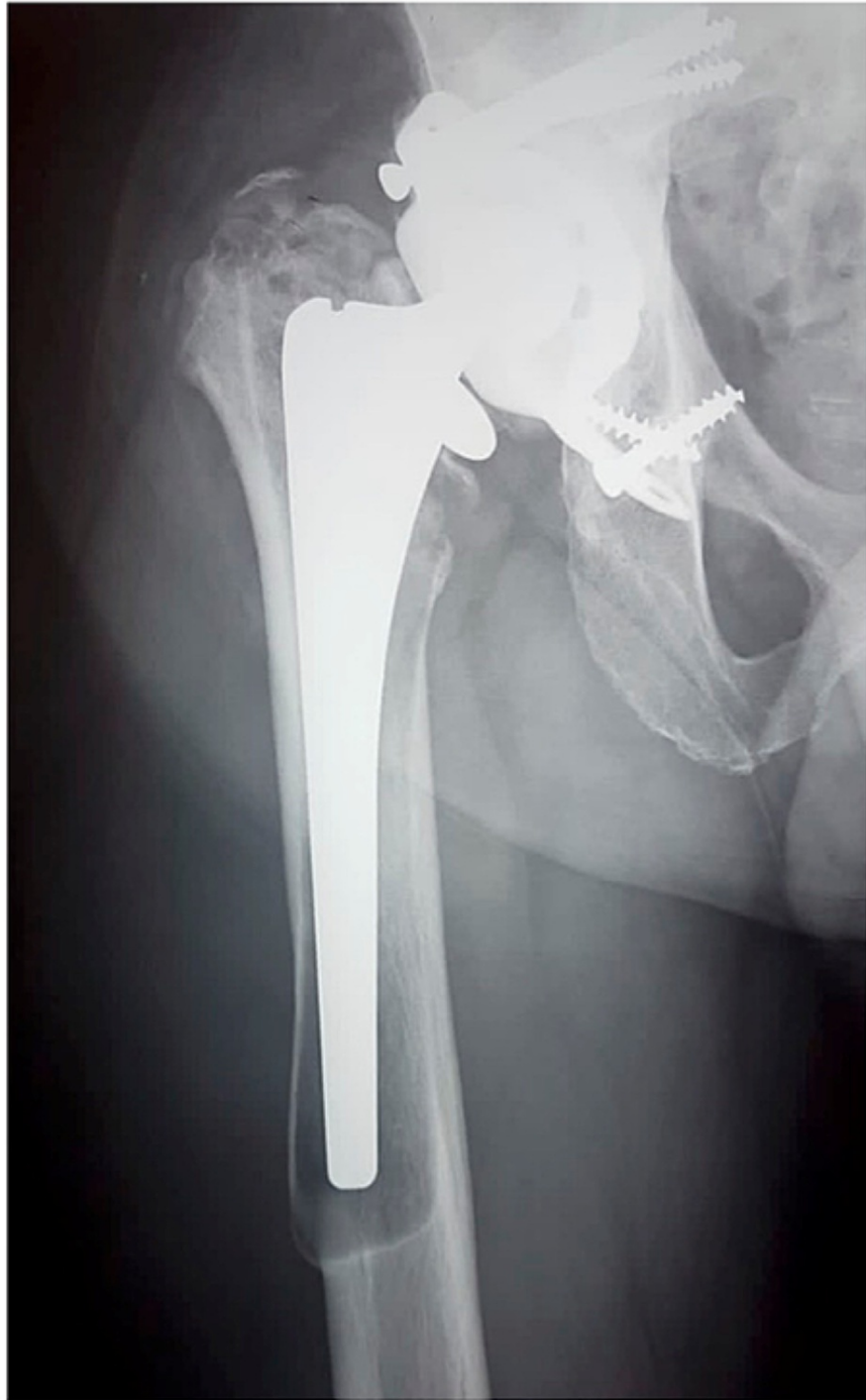
FIGURE 4: Radiograph showing progressive loosening of the femoral stem with distal migration and osteolysis at the tip of the stem with the risk of impending cortical perforation.

In preparation for surgery, he was cleared by the medical team. His blood investigations were normal (hemoglobin of 14.1 g/dL, serum creatinine of 0.96 mg/dL, C-reactive protein of 7.8 mg/dL, and erythrocyte sedimentation rate of 12 mm/hour). As part of our shared decision-making and informed consent process, we thoroughly counseled the patient about the risks of the surgery and specifically about the possibility that, in the presence of uncontrollable hemorrhage, the operation may need to be abandoned and completed in stages.