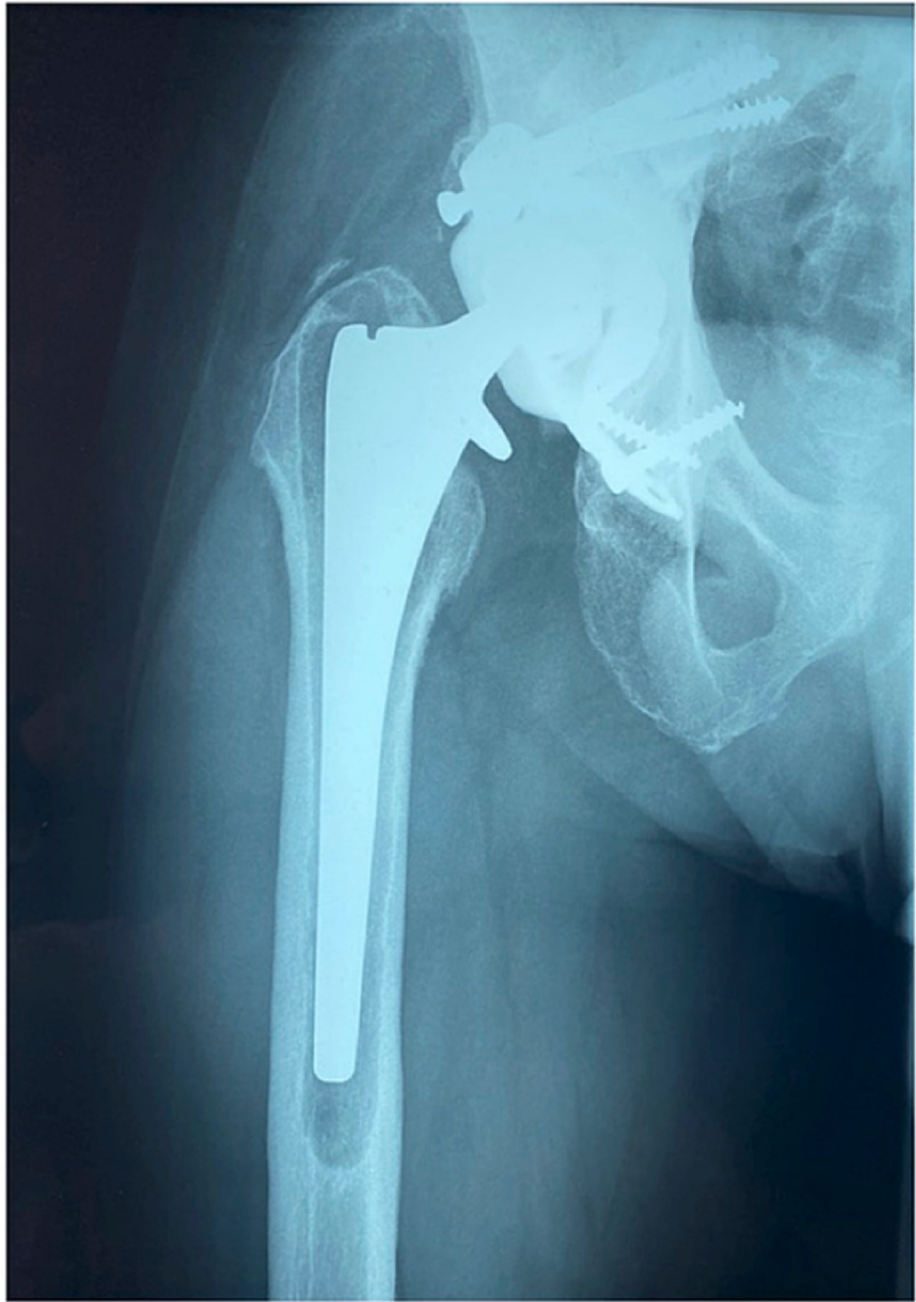
FIGURE 3: Radiograph of the hip replacement showing evidence of loosening of the femoral stem with lucent lines in Gruen zones 1-7.

On the current presentation, the patient complained of severe thigh pain, and radiographs showed evidence of femoral stem loosening (Figure 3).