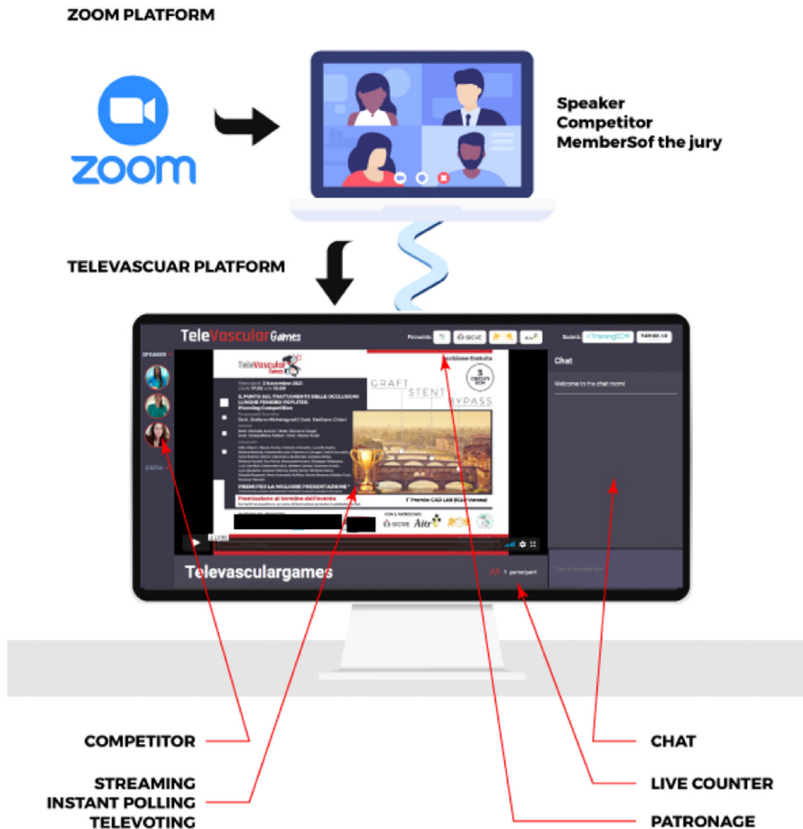
Fig 1. Scheme of how the Televascular event takes place simultaneously on the two streaming platforms. The ZOOM platform (top) and the Televascular Games platform (bottom).

the case were performed by the submitting competitors. The template required information on proximal and distal neck lengths and diameters and the presence of any target vessel angulation of more than 60^\circ ; any significant calcification (circumferential) or thrombus presence ( >50\% ) was measured. The measurements provided by the submitting competitors were compared with ones provided by the surgeons presenting the case, having as baseline these last measures. The calculation of an inter-rater agreement statistic (Kappa; ie, interobserver reliability) was evaluated and the \kappa value was interpreted according to Altman's criteria. 10 The value of \kappa strength of agreement was considered poor when less than 0.20, fair when between 0.21 and 0.40, moderate when between 0.41 and 0.60, good when between 0.61 and 0.80, and very good when between 0.81 and 1.00. SPSS version 15.0 software (SPSS Inc., Chicago, IL) was used for statistical analysis.