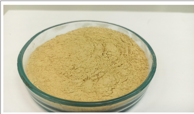
FIGURE 1 | Multicomponent synbiotic “Kormomix® Rumin”.