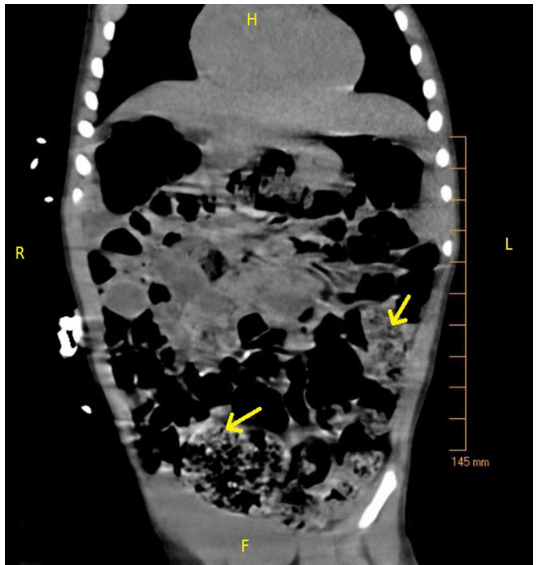
FIGURE 3: CT abdomen non-contrast, coronal view: large amount of stool and gas throughout the colon (arrows).

H, Head; F, Foot; L, Left; R, Right; CT, computed tomography