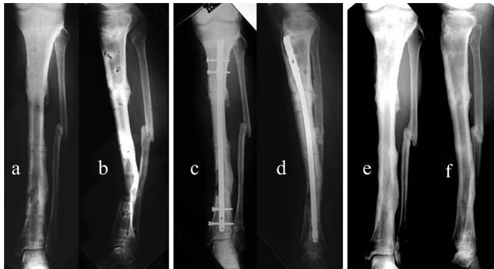
Fig. 3 Case 5: a, b preoperative X-ray, 1 month after the removal of the fixator, c, d postoperative checkup, e, f follow-up 3 years later