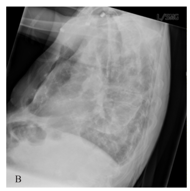
Figure 1A-B. 79-year-old man with reactivation tuberculosis and empyema necessitans 55 years following thoracoplasty. PA and lateral CXR demonstrate left upper rib resections, collapse of the left chest wall, opacification and volume loss of the left hemithorax and chest wall calcifications.

RCR Radiology Case Reports | radiology.casereports.net