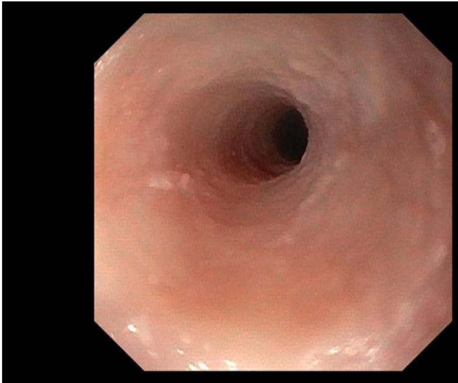
Fig. 1. Esophagogastroscopy before the onset of apremilast treatment shows LPM esophagitis with esophageal stenosis 20 cm ab ore.