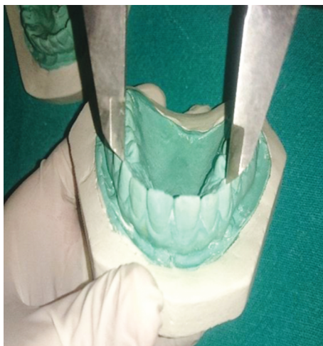
Fig. 2: Measuring intercanine width