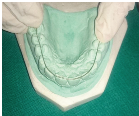
Fig. 4: Measuring arch perimeter with help of brass wire

patient's expectations as well as the treatment and retention plans designed by the clinician. 9