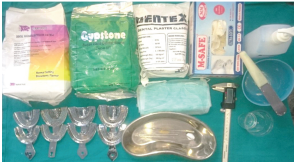
Fig. 1: Materials and armamentarium