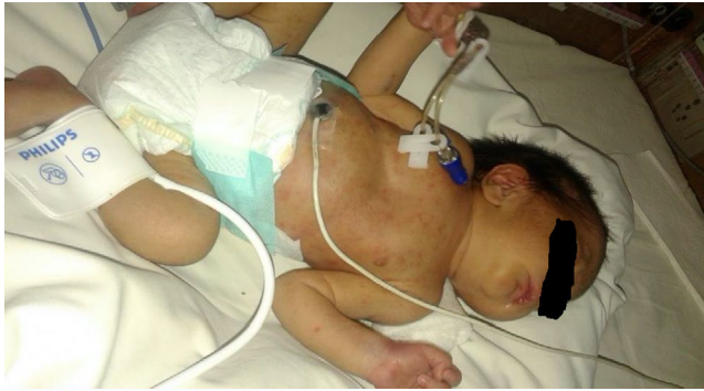
FIGURE 1 Neonate with maculopapular rash