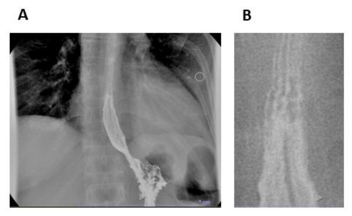
Figure 1: Videofluoroscopic swallowing study and esophageal transit evaluation. ( A ) Alterations of esophageal profile. ( B ) Detail of the proximal portion of barium column in A . Esophageal mucosa contrasted with a low amount of barium shows some horizontal lines suggesting the presence of rings.