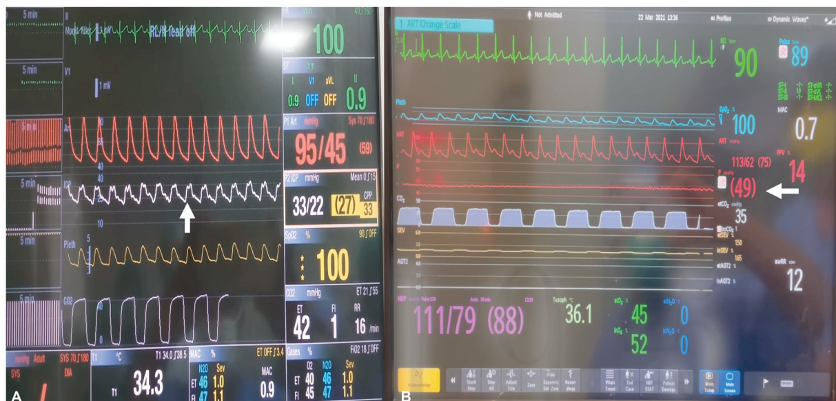
Fig. 2 (A) Appreciable intraventricular pressure (ICP No) waveform and value (white arrow). (B) Absolute ICP value without appreciable ICP waveform (white arrow).

To explore the feasibility of continuous intraoperative ICP monitoring, subdural ICP was measured in three patients using an intravenous cannula connected to the pressure transducer. Subdural ICP monitoring in these patients helped to make critical intraoperative clinical decisions based on the