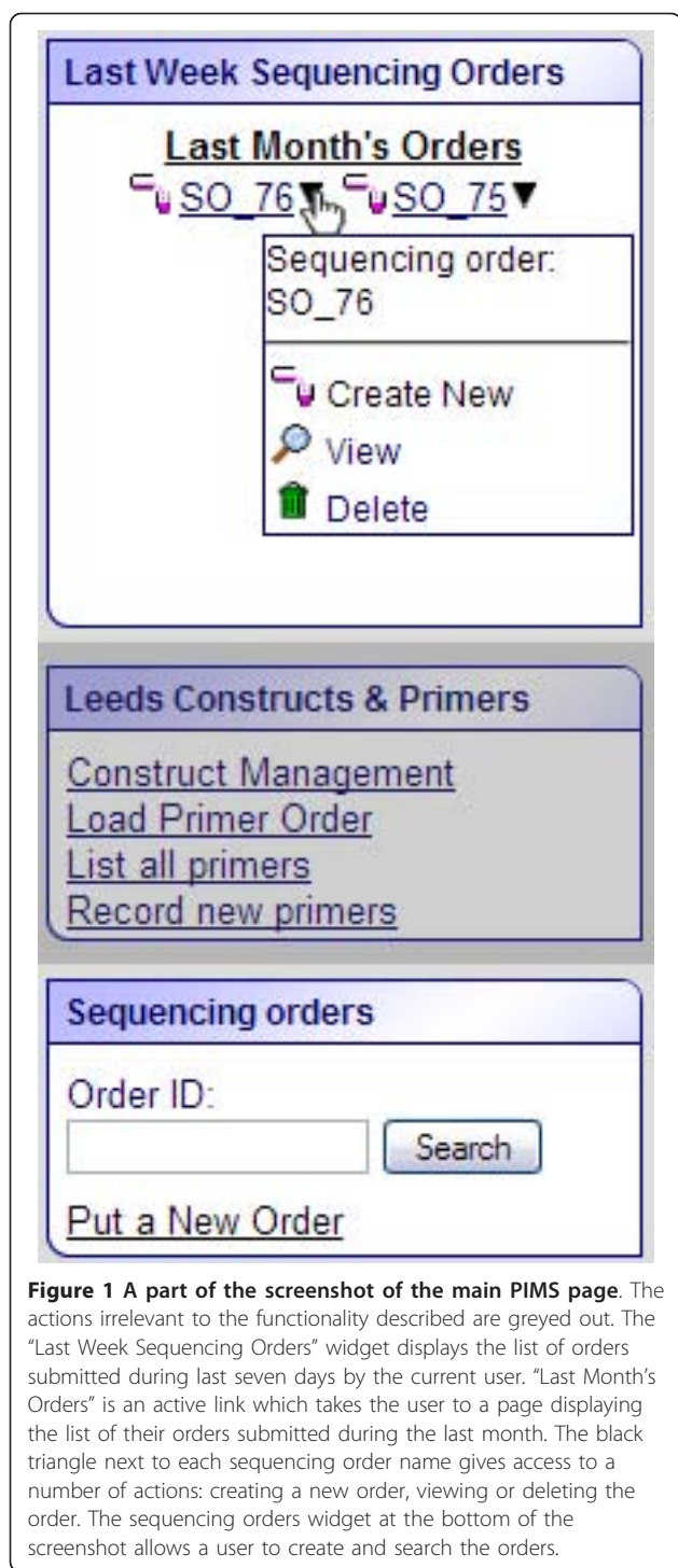
Figure 1 A part of the screenshot of the main PIMS page. The actions irrelevant to the functionality described are greyed out. The "Last Week Sequencing Orders" widget displays the list of orders submitted during last seven days by the current user. "Last Month's Orders" is an active link which takes the user to a page displaying the list of their orders submitted during the last month. The black triangle next to each sequencing order name gives access to a number of actions: creating a new order, viewing or deleting the order. The sequencing orders widget at the bottom of the screenshot allows a user to create and search the orders.

One of the frequent irritations of large computer systems is the difficulty of locating the desired information. Accordingly, the PIMS sequencing extension is designed to display only the information relevant to the user. For example, when the user logs into PIMS, the main page displays the orders recently submitted by this user. Older orders or orders which do not belong to the user