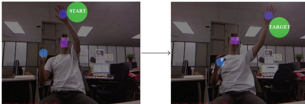
FIGURE 2: Super Pop VR game with “Super Bubble.” The green bubble on the screen is a “Super Bubble.” The player was moving his left hand from Super Bubble 1 to Super Bubble 2. The sizes of “Super Bubble” can be adjusted.

GMFCS: Gross Motor Function Classification System; MACS: Manual Ability Classification System.