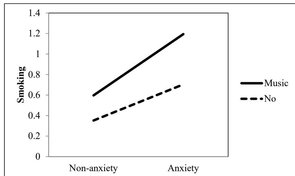
Figure 4. Interaction between anxiety and music as a TV genre on smoking behavior.