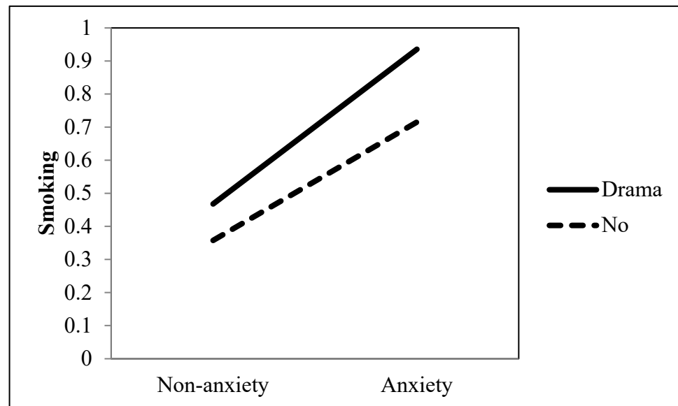
Figure 3. Interaction between anxiety and drama as a TV genre on smoking behavior.

Research Question 1 investigated the role of ambiguously-valenced entertainment television viewing in the association between an anxiety disorder and smoking behavior. Our findings showed that the positive association between an anxiety disorder and smoking was significantly accentuated when they watched drama ( b = 0.213, p = 0.002 ), music ( b = 0.293, p < 0.001 ), and sci-fi ( b = 0.170, p = 0.005 ) (see Table 1 and Figures 3–5). However, movies did not moderate the association between an anxiety disorder and smoking ( b = -0.129, p = 0.051 ).