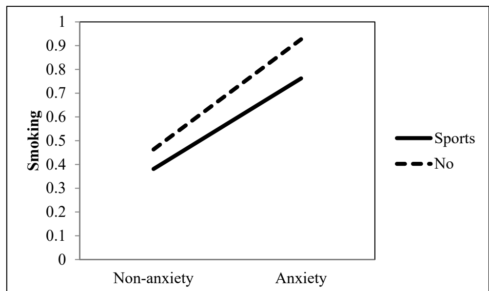
Figure 2. Interaction between anxiety and sports as a TV genre on smoking behavior.