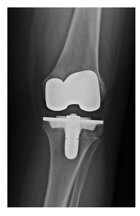
Figure 1. Preoperative X-ray of knee joint with Streptococcus anginosus infection of patient number 5.

amounted to USD 567,340. If these patients had been treated using 2-stage revision, the costs would have totaled USD 858,492 (18 patients \times USD 47,694 per patient) without any complications. Therefore, the total economic savings for our hospital for these 18 patients was USD 291,152.