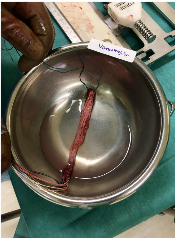
Fig. 4. Pre-soaking of graft with vancomycin solution before pre-tensioning.