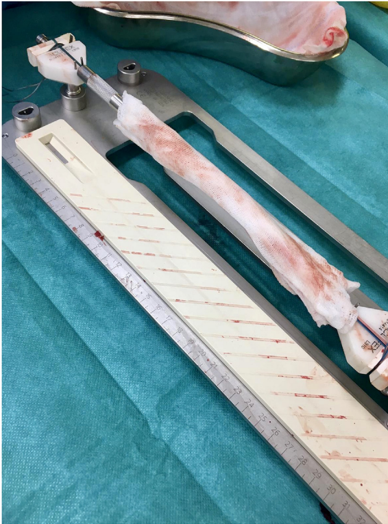
Fig. 3. The vancomycin wrap.