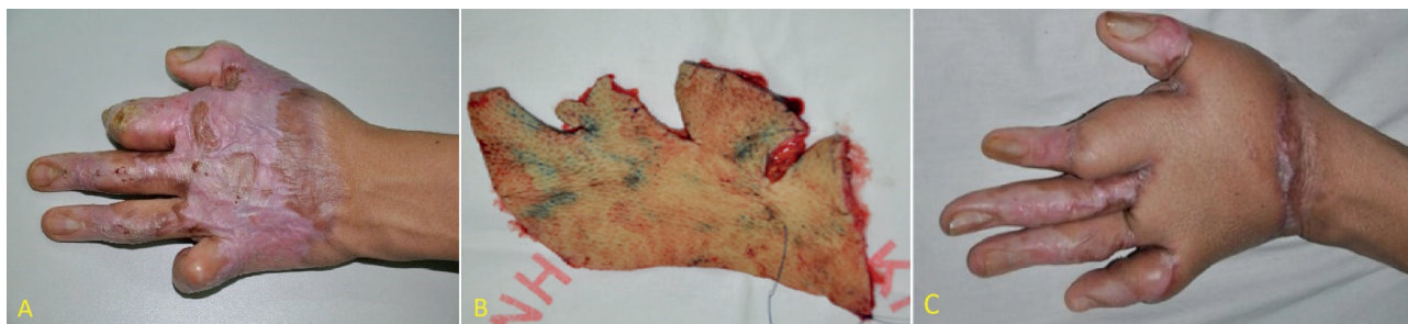
Figure 2. Microdissected tailoring of the free anterolateral thigh flap to reconstruct the left hand. A: Burn scar of the dorsal hand. B: Microdissected tailoring. C: Six months after operation.