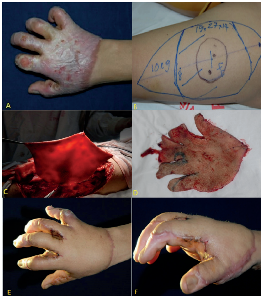
Figure 1. Microdissected tailoring of the free anterolateral thigh flap to reconstruct the right hand. A. Burn scar on the right hand. B. Flap design. C. Microdissected flap. D. Microdissected tailoring. E, F. Six months after operation.

sected under a microscope. Fat lobules were eliminated from the distal margin to the point at which their distance to the perforator was 1.5 cm. The thickness of the flap after dissection was 2.5 mm. Subsequently, the flap was designed and cut using the tailoring method, and the subcutaneous vessels were secured. The resulting flap had the shape of a glove (Figures 1 and 2). The surgery on the left hand was conducted 3 months later using the same technique. Six months after the operation, the flaps had completely survived on both hands, and the color was compatible with the hand skin. The itching symptom vanished and did not reappear at the scar of the flap border. Flexion movement dramatically improved with the successful replacement of the scar tissue with the healthy flap tissue. Because of the symptoms of induration, parts of the extensor tendons were fibrotic, so we observed only marginal improvement. The patient was able to perform daily activities, including wearing gloves and long sleeve shirts and holding a bowl while eating.