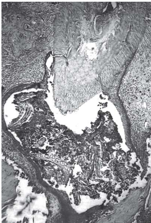
FIGURE 3- Periradicular cyst formation in a diabetic rat after 40 days of pulpal exposure. Note the presence of food and tissue debris in the cyst lumen (hematoxylin and eosin, original magnification 100x)

Diabetes is associated with innumerable complications,