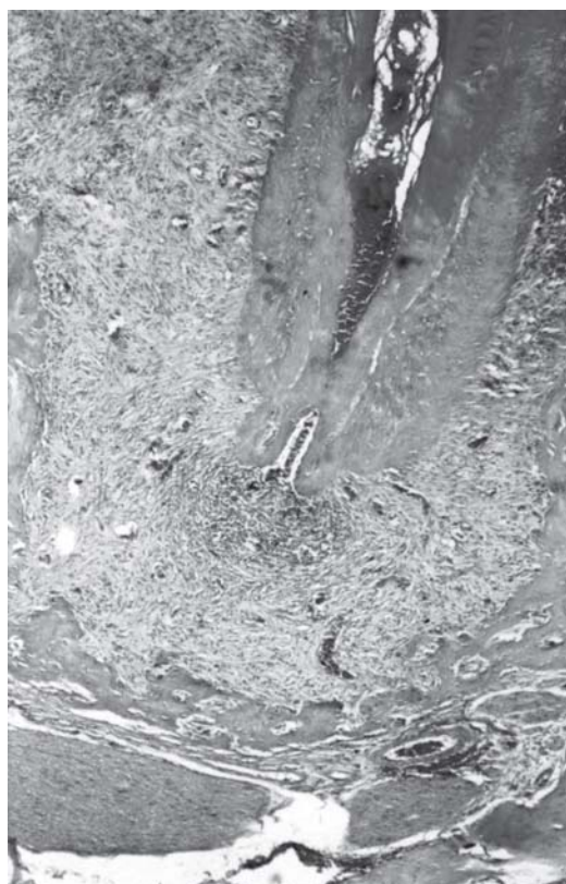
FIGURE 2- Large periradicular lesion (granuloma) in a diabetic rat after 40 days of pulpal exposure. Note the intense inflammatory infiltrate concentrated near the apical foramen (hematoxylin and eosin, original magnification 100x)