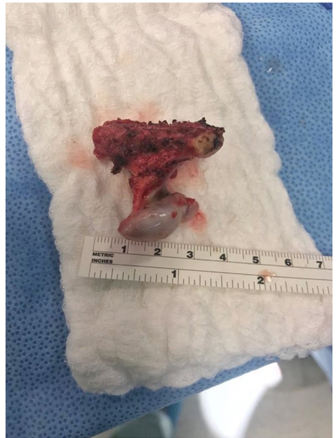
Fig. 2. Resected mass consisted of part of the left fifth rib along with an attached lesion of bony protrusion with a cartilaginous cap.

Histological sections showed mature bone covered by a cartilaginous cap with benign appearing chondrocytes. In addition, no permeation of bone or extension into soft tissue was seen. Histological features were consistent with osteochondroma and the diagnosis was confirmed. Post-operatively, the patient was complication-free and was discharged asymptomatic with simple instructions such as wound care and safety netting.