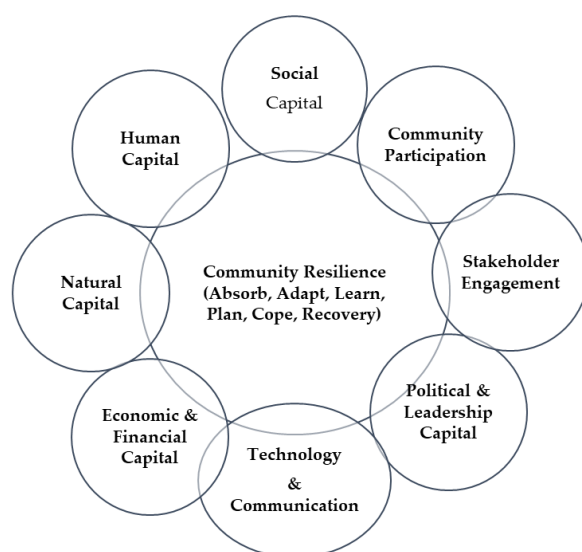
Figure 1. Factors of community resilience.