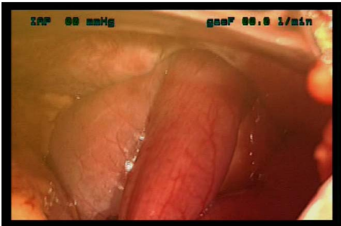
FIGURE 2. Intraoperative picture showing the loop of ileum herniated through the left lower 12-mm port site. Note the dilated proximal limb and the decompressed distal limb at the point of herniation.

The rationale for nonclosure of blunt trocar sites is derived from several animal studies that have shown that blunt trocar fascial defects were smaller in area, shorter in length, shorter in width, and had less destruction of fascial tissue compared to bladed trocars. Furthermore, separation (rather than transection) of musculature has been observed with blunt trocar insertion, and this separation generally reapposes after trocar removal[7,8].