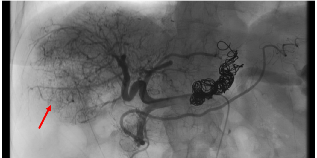
FIGURE 1: Large hypervascular tumor seen on selective angiogram of the hepatic artery before TACE (red arrow).

The patient underwent TACE with LC beads (Boston Scientific, Marlborough, MA) and doxorubicin (Figure 1).