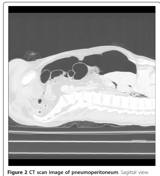
Figure 2 CT scan image of pneumoperitoneum. Sagittal view.

results for smaller perforations, like those resulting from therapeutic colonoscopies (e.g. polypectomy), as opposed to those caused by diagnostic colonoscopies [17]. These patients should receive intravenous fluids, keep absolute bowel rest and they should be treated with intravenous broad-spectrum antibiotics. If the conservative treatment is successful, the patient's general condition should