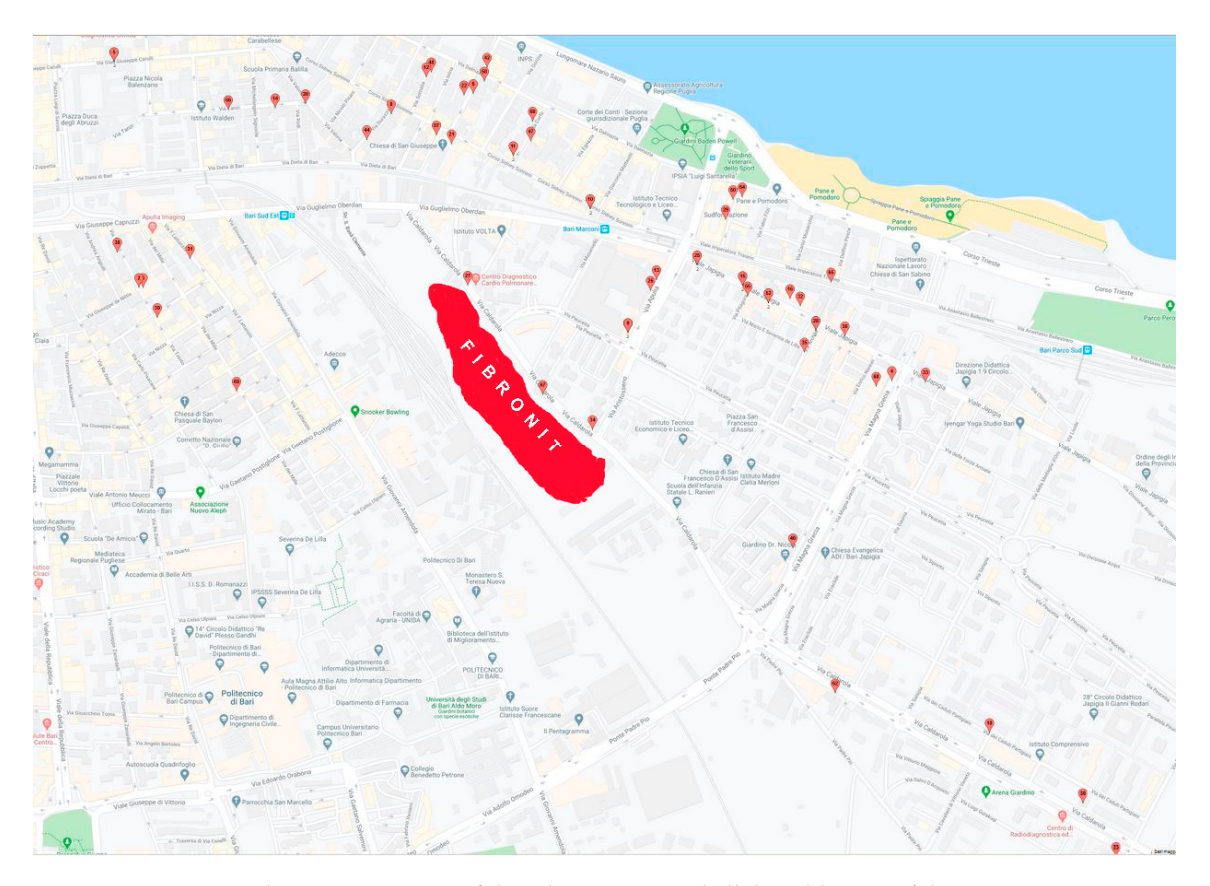
Figure 1. Graphic representation of the Fibronit area and all the addresses of the 71 MM cases.

Of the total number of MM cases among Bari residents, 9.85% had the only environmental exposure linked to the proximity of the residence, within 3000 m, to the Fibronit factory (Figure 1).