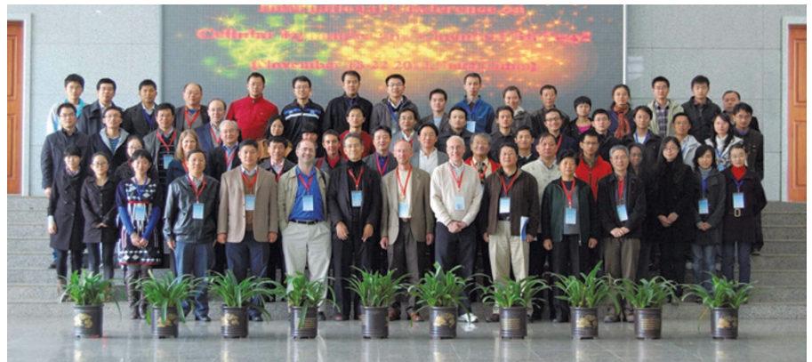
Figure 3 | Participants in the Second International Conference on Cellular Dynamics and Chemical Biology. This meeting, held at the University of Science and Technology of China (USTC) in Hefei, China, in November 2010, brought together researchers working in the disciplines of photonics, chemistry and biology. The conference covered six topics: cell cycle and circadian rhythms, cell division and genomic stability, epigenetic and epigenomic stability, the chemical biology of enzymes, cell plasticity and homeostasis, as well as new technologies.

It is also important to mentor young scientists at the early stages of their careers, as the scientific community needs 'new blood' to ensure that great scientific discoveries are made in the future. It is interesting to note that the tenure-track system has begun to be launched at universities and institutes in China, such as Tsinghua University and the NIBS, to promote the career development of early stage and mid-stage scientists. Given the differences in research culture between the West and China, it will be very helpful for young principal investigators