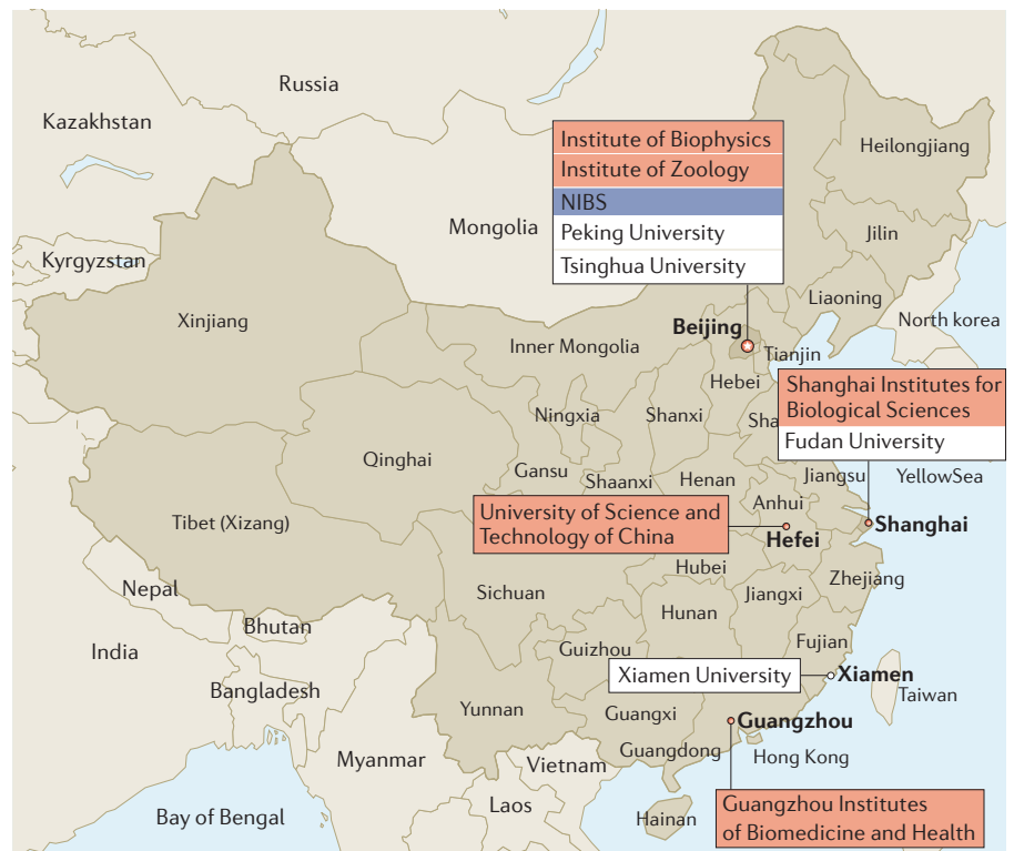
Figure 2 | Map of representative institutions under the different MCB research programmes in China. Historically, there are two main streams of molecular and cell biology (MCB) research programmes in China. One pipeline is orchestrated by the Chinese Academy of Sciences (CAS). CAS includes 20 institutes studying biological sciences at which diverse subject areas are being investigated. The second avenue is governed by the Ministry of Education (MOE), and this includes several universities. The newly established National Institute of Biological Sciences (NIBS) represents the third system. The map illustrates the geographic locations of five representative institutions under CAS (orange), four representative universities under the MOE (white) and the NIBS (purple).

Finally, there are programmes similar to the Thousand Talent programme aiming to recruit tenured faculty members of foreign nationalities. The programme is called 'Thousand Talent for Foreign Scientists' (also known as 'Wai Zhuan Qian Ren'). Collectively, all these programmes are designated for Chinese scientists who return from overseas or foreign scientists who want to work in China. By contrast, funding programmes for Chinese scientists who would like to perform research abroad are scarce, except for scholarships for graduate students and postdoctoral fellows to visit foreign institutions. All career development plan applications begin with the human resources department of the perspective institutes and/or universities. There is a dramatic increase in academic job advertisements from Chinese institutes in major scientific journals, such as Science and Nature , and on the institutes' websites. Often all interested candidates are invited to apply, regardless of their nationalities.