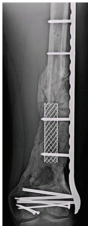
FIGURE 4: Radiograph demonstrating remarkable regrowth of new bone surrounding the endosteal titanium implant at 8 months post-procedure. Note the contour of the new bone, formed within the pseudocapsule which resulted from the initial antibiotic cement spacer used in the first stage of the Masquelet technique.

membrane was encountered with evidence of aggressive callus formation already in place at the site of the antibiotic cement spacer (Figure 4). The pseudomembrane was cleanly incised anteriorly, and the antibiotic spacer was broken up using an osteotome and the fragments were removed. The composite fixation component of the procedure was then introduced by placing a titanium cage fixed into place and extending from the proximal diaphyseal fracture limit to the distal femoral fragment, within the confines of the pseudomembrane (Figure 3). This cage was attached to the lateral plate with screws, providing stabilization for the construct from within as well as the outside of the segmental fracture.