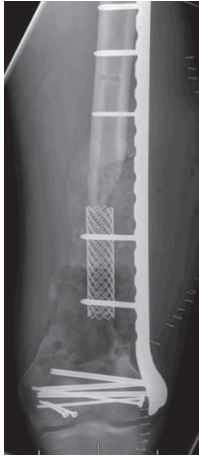
FIGURE 3: Composite fixation consisting of lateral locking distal femoral plate with endosteal titanium cage augment.