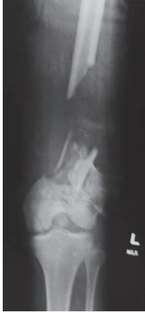
FIGURE 1: Original injury depicting 17 cm of segmental bone loss in the distal metadiaphyseal aspect of the right femur.

published support for superiority of either technique at two years, were thoroughly discussed [1]. Despite the probability of multiple surgeries over the course of approximately the next year, the attendant risks of each surgery, and the very real possibility of enduring pain and challenging control measures, the patient opted for the limb salvage option. We then set about formulating a surgical plan to provide the best possible outcome to that end.