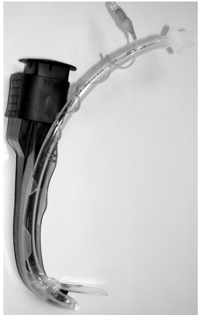
Figure 1 Photograph of the Airtraq® laryngoscope with a tracheal tube in place in the side channel.

Each AP received a standardized training session with the Airtraq®, the Truview® and the Macintosh laryngoscopes. This included a demonstration of the intubation technique with each device, and verbal instructions regarding the correct use of each device. The use of optimization manoeuvres, such as external laryngeal pressure, to facilitate intubation with the Macintosh was also demon-