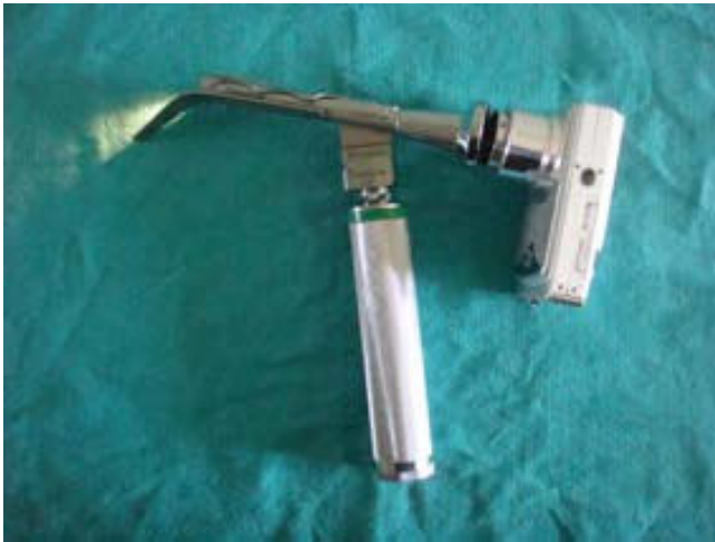
Figure 2 Photograph of the Truview® laryngoscope with camera attachment which clips onto eyepiece.

in a SimMan® manikin (Laerdal®, Kent, UK) in the following laryngoscopy scenarios: (1) normal airway in the supine position; and (2) following the application of a hard neck collar. A maximum of 3 intubation attempts were permitted with each device in each scenario. The primary endpoint was the duration of successful tracheal intubation attempts. The duration of each tracheal intubation attempt was defined as the time taken from insertion of the blade between the teeth until the ETT was deemed to be correctly positioned by each participant. Endotracheal tube placement was determined by each participant by direct visualization. Where the participant was unsure as to the position of the ETT, the time taken to connect the ETT to an Ambu® bag and inflate the lungs was also included in the duration of the attempt. In any case, after each intubation attempt an investigator verified the position of the ETT tip. A failed intubation attempt was defined as an attempt in which the trachea was not intubated, or where intubation of the trachea required greater than 60 seconds to perform.