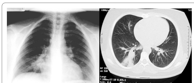
Figure 1 Chest radiograph revealed an ill-defined rounded infiltrate in the right lower lobe (white arrow).

Transthoracic echocardiography showed a 1.8 cmx1.6 cm non-mobile right ventricular mass attached to her interventricular septum. Transesophageal echocardiography showed the same mass having a texture similar to her papillary muscle. A cardiac MRI was subsequently done, which showed a right ventricular mass with the same signal of the cardiac muscle. An aneurysm in her right interlobar pulmonary artery was also seen (Figure 3). Further laboratory workups ruled out other connective tissue diseases except for elevated lupus anticoagulant level (LA1 = 54.9, normal = 30 to 44; LA2 = 37.2, normal = 26 to 32).