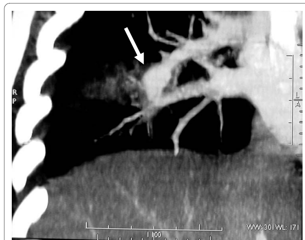
Figure 3 Cardiac magnetic resonance imaging showed the aneurysm in the right interlobar pulmonary artery (white arrow).

Our patient's postoperative course was uneventful. A few days later, however, she developed swelling in her right lower limb. Doppler sonography revealed deep vein thrombosis in her right iliac, right common femoral, right superficial femoral and right popliteal veins. Spiral CT scan of her chest showed a small filling defect in her right apical segmental artery consistent with pulmonary embo-