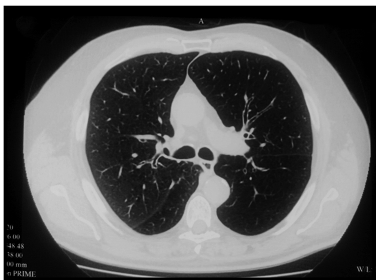
Figure 2 CT of a patient with emphysema with giant bulla.

Surgical (nonbronchoscopic) lung volume resection is performed in patients with emphysema to achieve expansion of healthy lung tissue that surrounds giant bullae. Bullectomy can be performed using two surgical approaches