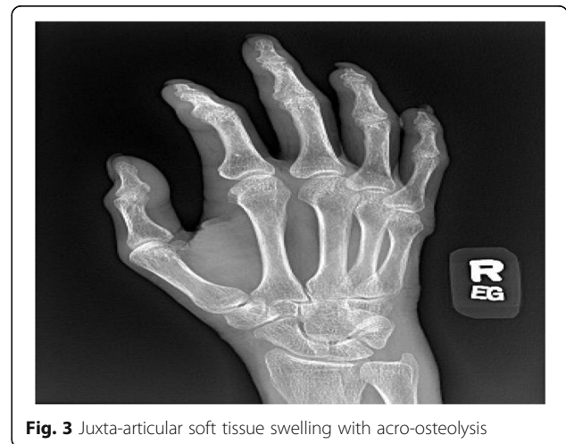
Fig. 3 Juxta-articular soft tissue swelling with acro-osteolysis