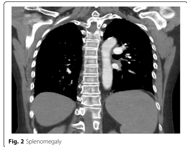
Fig. 2 Splenomegaly

The patient presented to the emergency room with one-week history of sore throat, intermittent spiking fevers, myalgias, arthralgias, and non-pruritic bilateral lower extremity rash. Past medical history was significant for peptic ulcer disease, mitral valve prolapse, chronic idiopathic pancreatitis, and limited cutaneous scleroderma with manifestations of sclerodactyly, Raynaud's, and calcinosis. Scleroderma had been diagnosed two decades prior. The patient had not been seen by a rheumatologist in four years, however she reported her skin and joint symptoms had been well controlled during this time. On physical exam, the patient was tachycardic (106), with palpable splenomegaly, and also had bilateral knee swelling with limited range of motion. Lab results were remarkable for leukocytosis (22,600) with leftward shift (88% PMNs), abnormal liver function tests—alkaline phosphatase (125), aspartate aminotransferase (50)—and elevated inflammatory markers—Ferritin (20,128), ESR (34), and CRP (206). There was no eosinophilia observed on the complete blood count. CT chest, abdomen and pelvis showed new mediastinal adenopathy and splenomegaly (Figs. 1 and 2). She was admitted